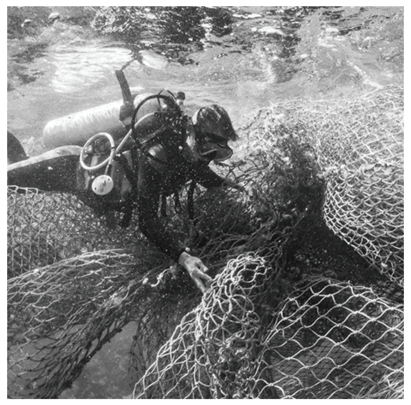
INTERCEPTED FROM OCEANS, REDESIGNED FOR ADVENTURE