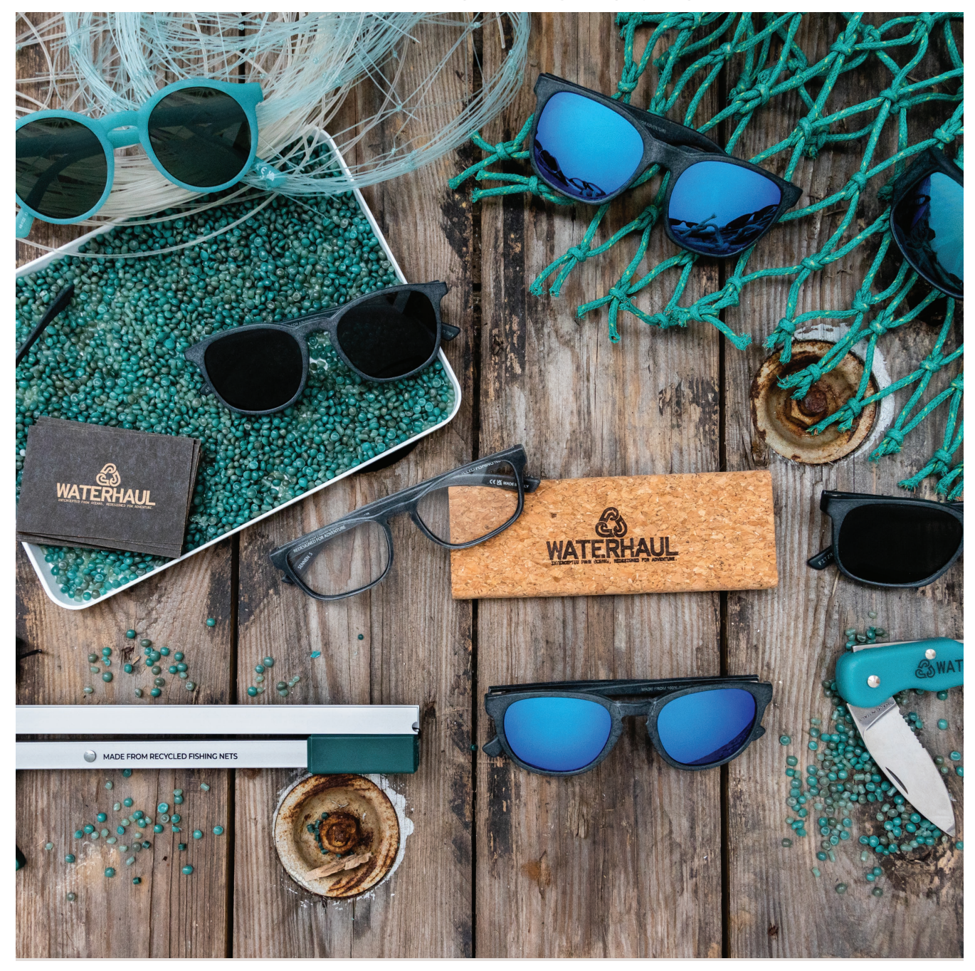
Catalogue 2021 / 2022