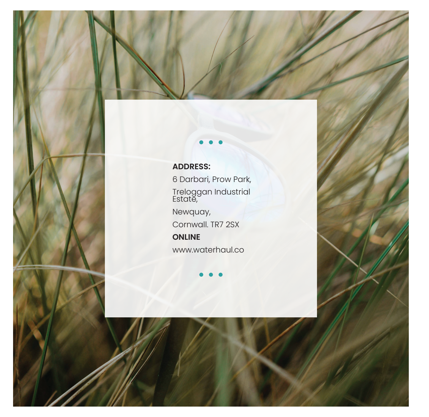
INTERCEPTED FROM OCEANS, REDESIGNED FOR ADVENTURE

Kieran Hill Kieran@waterhaul.co 07801577891 https://waterhaul.co